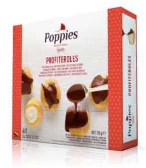
Profiteroles ± 20 profiteroles filled with dairy cream and 2 sachets of chocolate sauce

Cases/EU pallet: 77 Shelf life in months: 18