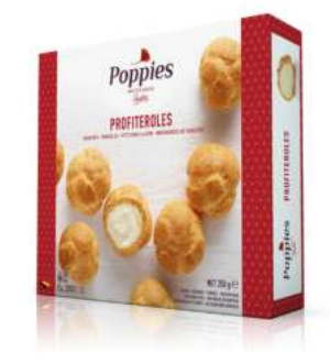
Profiteroles ± 20 profiteroles filled with dairy cream