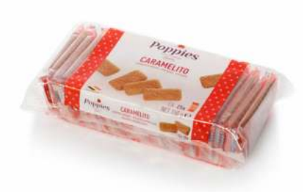
Caramelito Single packed caramelised cookies

"No biscuit is more Belgian than the caramelised biscuit or speculoos. A special, secret mix gives the cookie its characteristically sharp, sweet flavour."