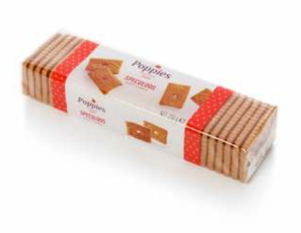
Speculoos Caramelised cookies

Cases/EU pallet: 180 Shelf life in months: 9