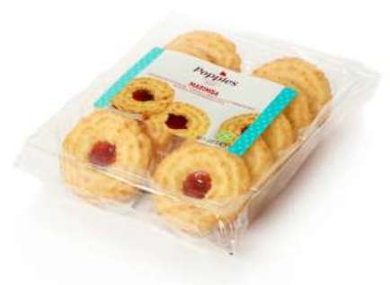
Marimba 10 coconut rings with strawberry jam

Cases/EU pallet: 84 Shelf life in months: 8